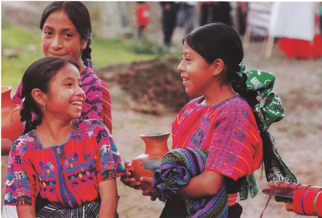
Girls from Santo Domingo Xenacoj.

A WEAVING TRIP to Guatemala will be sponsored by Friends in 2004.