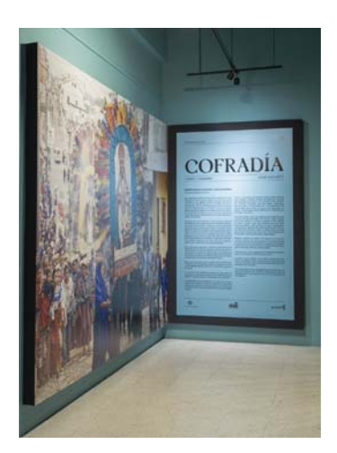
Refreshed Cofradía exhibit

An important part of our mission is educating the general public on the beauty and intricacy of Guatemalan weaving. It is one that we share with the Museo Ixchel.