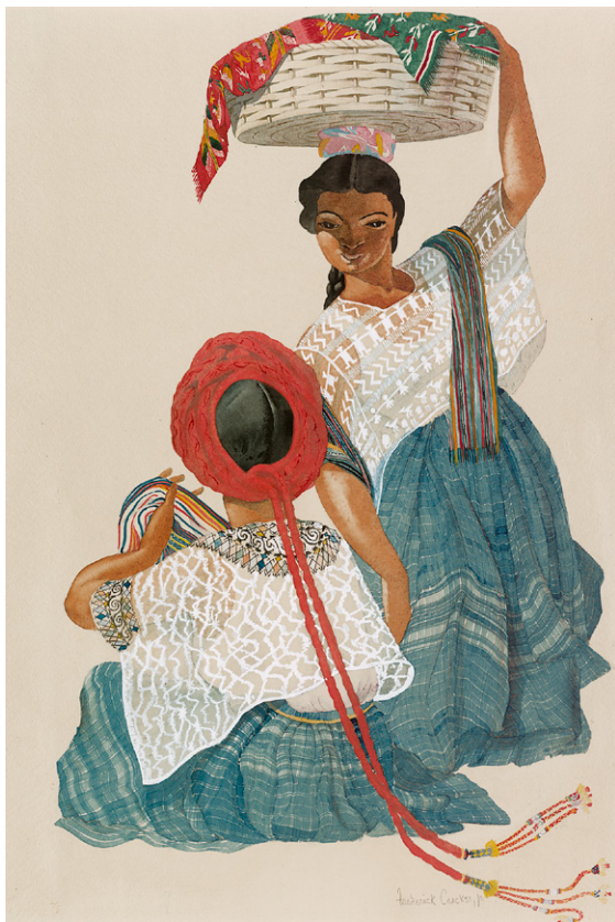
Two women from Coban by Pat Crocker.